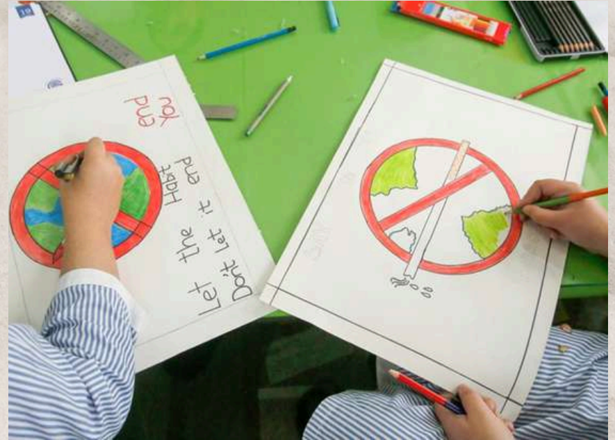
Poster Competition by students of Art Club on the theme World No Tobacco Day